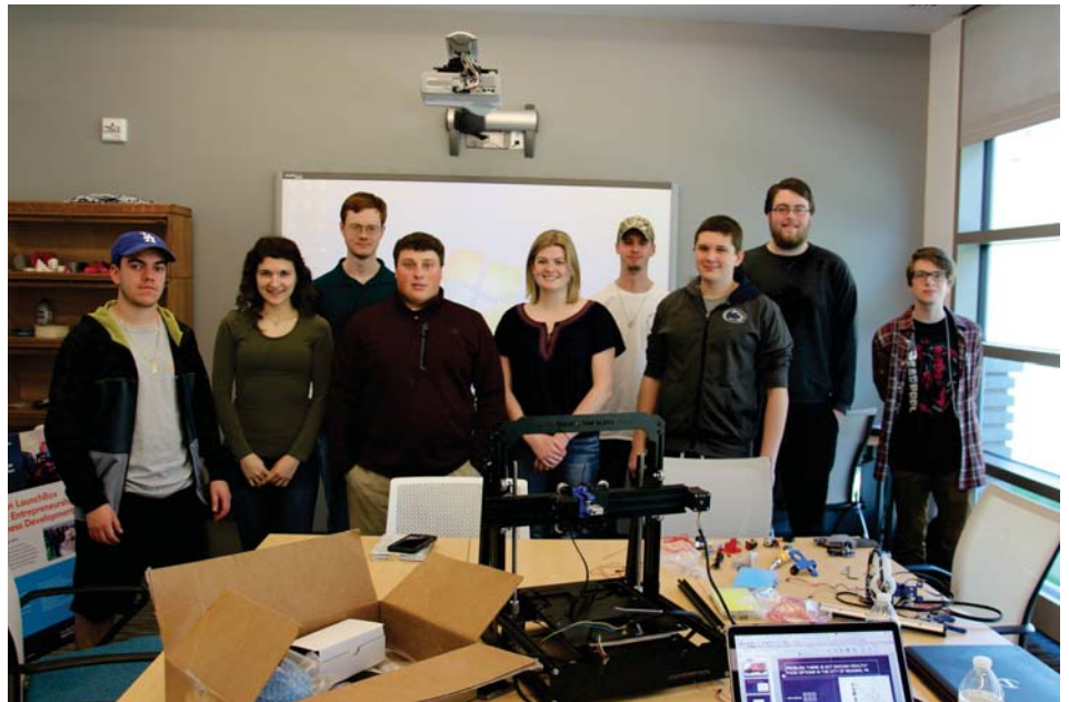
The Food Truck team evolved in the Entrepreneurship student club and was a finalist in the 2017 Reading Chamber of Commerce Business Idea Challenge.

The mission of the Fleming Creativity, Entrepreneurship and Economic Development (CEED) Center is to inspire an entrepreneurial spirit and innovative thinking in the Penn State University Berks Community. The Fleming CEED Center seeks to foster growth and development in the Greater Reading area through technology based solutions, human capital development and enterprise creation.